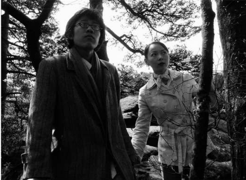
Yang Fudong, Seven Intellectuals in Bamboo Forest Chapter 1 (2003), Video still