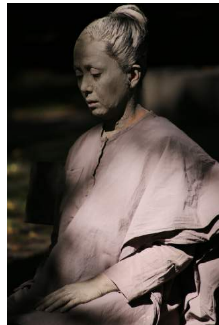
Tyler Rollins Fine Art, Arahmaiani , Opening Reception, Thursday, September 15, 6-8pm. Performance, 7pm. Image: Shadow of the Past , performance, 2015.

Scattered throughout the three months are gallery exhibitions and installations at major art museums by contemporary South Asian artists that reflect on the need for peace and tolerance amid chaos and acts of violence. In Philadelphia, the latest series of drawings by Amina Ahmed at Twelve Gates Arts (Sept 2nd), display her exercises in geometry to invoke grace and hope; at Philadelphia Museum of Art , Mumbai-based artist Jitish Kallat debuts an immersive installation of the historical correspondence written by Mahatma Gandhi to Adolf Hitler in 1939 (Nov 13th). In New York, Rubin Museum of Art commissions an eighteen-channel audio installation by Soundwalk Collective to transport visitors to sacred sites in the high Himalayas for a meditative experience (Nov 11th). Aicon Gallery presents the works of the Pakistani, London-based minimalist icon Rasheed Araeen (Sept 20th), while Sundaram Tagore opens a new show of works by artist, poet and Tantric guru, Sohan Qadri (Sept 15th). DAG Modern's group exhibition, Memory and Identity: Indian Artists Abroad considers 15 seminal artists such as S H Raza , V Viswanadhan , Zarina Hashmi and Krishna Reddy , who have opted to live overseas, and how memory and identity play into their processes (Sept 14th). At Sundaram Tagore Gallery , an exhibition of new works by Filipino Brisbane-based husband-and-wife artists Alfredo and Isabel Aquilizan , explores