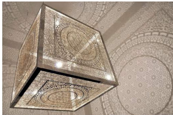
Aicon Gallery , Anila Quayyum Agha , Thursday October 20, 6-8pm, Opening Reception. Image: All the Flowers Are for Me (Installation View, BAM, New York, 2016), 2015. Laser-cut stainless steel & bulb, 60 x 60 x 60 in.

displacement, change, memory and community (Oct 13th). Artists based in Japan presenting during ACAW 2016 also reflect on the current social climate in distinct ways. At Ronin Gallery , an exhibition dedicated to “the ambassador of kawaii culture,” Sebastian Masuda , extols the artist’s message of ‘colorful rebellion’ against a climate entrenched in disharmony (Oct 27th). At Sundaram Tagore , a solo exhibition for internationally renowned artist Hiroshi Senju displays his sublime, monumental waterfall images that bestow viewers with a sense of tranquility (Nov 10th). Transcultural (and – temporal) exhibitions presented this year during ACAW 2016 include At Twilight by Simon Starling at Japan Society , who found inspiration in W.B Yeats and other early 20th-century artists to create his expansive Noh theater installation (Oct 14th); and an exhibition at Owen James Gallery , revolving around a collaboration between the Singaporean art collective Phunk and renowned post-war Japanese pop artist Keiichi Tanaami (Sept 16).