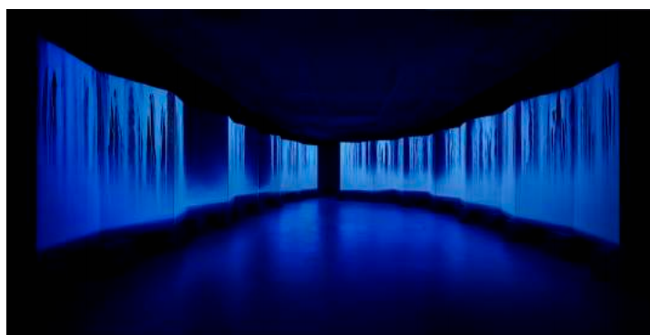
Sundaram Tagore Gallery , Hiroshi Senju , Opening Reception, Thursday, November 10, 6-8pm. Image: Ryujin II , 2014. Acrylic and fluorescent pigments on Japanese mulberry paper, 7.9 x 37.4 feet/2.4 x 11 meters.

At Sylvia Wald & Po Kim Gallery , light installations and other work by six emerging and established Korean artists, including Hyong Nam Ahn, Dong Chul Ha, Han Ho, Moha Ahn, Yunwoo Choi and Choong Sup Lim, comment on the physical and spiritual dimensions of their environments (Sept 28). Doosan Gallery presents three solo exhibitions for artists based in Korea this fall, exploring internal worlds and taboo subjects (Sept 8th, Oct 13th, and Nov 17th). Art Projects International celebrates Korean-American contemporary artist Il Lee ’s 40 years in New York City, contextualizing the range of gestures and movements he has developed in his ballpoint works over the last four decades (Sept 22nd).