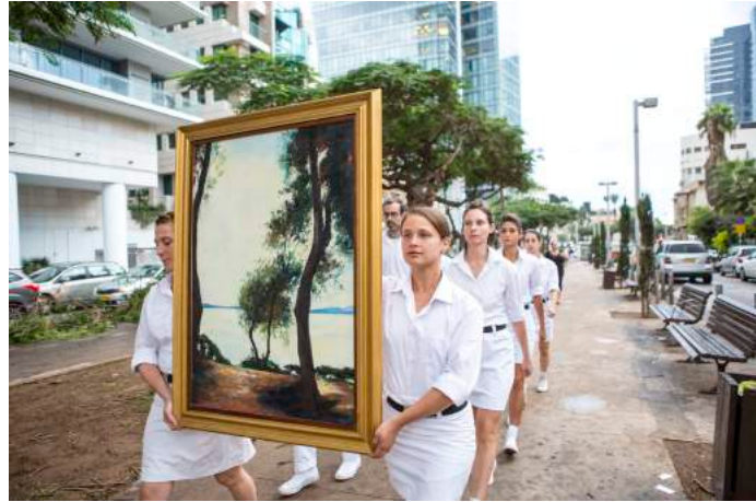
Solomon R. Guggenheim, Public Movement, Museum Operations, Performance . Saturday, September 24 & Sunday, September 25 Time TBA. Image: National Collection , 2015. Tel Aviv Museum of Art.

The 11th edition of ACA AW comprises a broad scope of content—from comprehensive surveys on major mid-20th Century artists previously unobserved in the United States, to timely symposiums, performances and discussions contextualizing major solo and group exhibitions for established, emerging and diasporic artists of China, India, Japan, Korea, Indonesia, Iran, Lebanon and other countries of the Middle East, South and Southeast Asian regions. Beyond an interlacing of broad cross-cultural aesthetic and conceptual inquiries, works in this year's ACA AW echo the present anxious state of the world, concentrating on socio-political issues such as war, terrorism, environmental deprivations, inequality, and immigration. This year also marks important milestones in the history of Asian art in the United States—with the 60th anniversary of Asia Society, and the Metropolitan Museum of Art's Asian galleries turning 100.