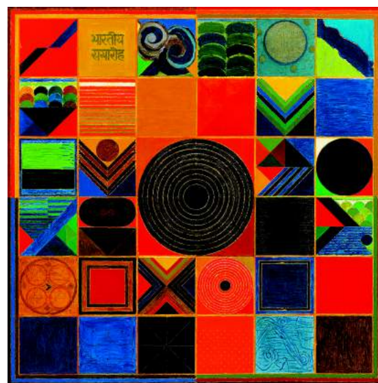
DAG Modern, Memory and Identity: Indian Artists Abroad , Opening Reception Wednesday, September 14, 6-9pm. S H Raza, Bharatiya Samagrah , 1988, Acrylic on canvas, 59" x 59", Courtesy of the gallery.