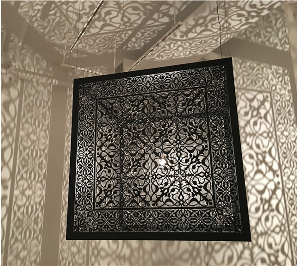
Anila Quayyum Agha, 'Shimmering Mirage', 2016. Laser-cut black steel and bulb, 36 x 36 x 36 in.