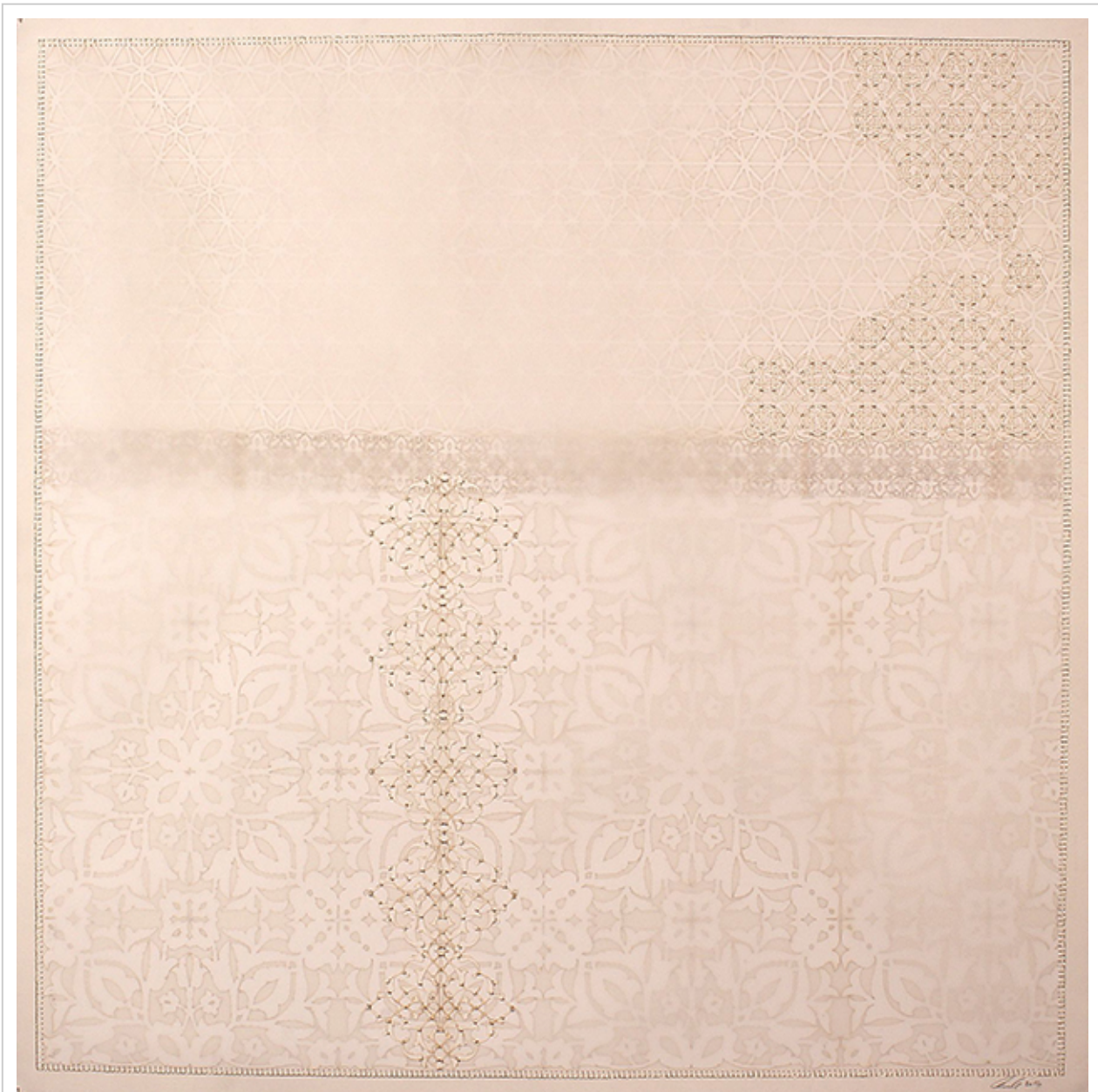
Anila Quayyum Agha, 'SHIMMERING MEMORIES - 1', 2016. Mixed media on paper (Laser-cut patterns on paper with mylar, embroidery and beads) 39.5 x 39.5 in.