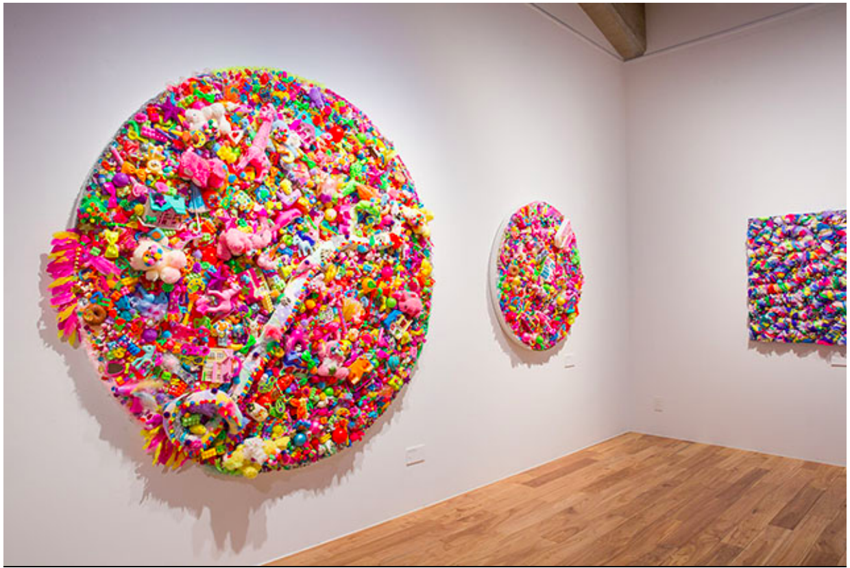
Sebastian Masuda, "True Colors", 2014. Installation shot.