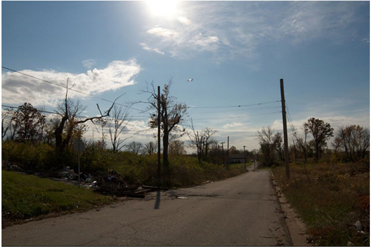
Mariam Ghani, 'The City & The City: Kinloch Flight Path', 2015. Inkjet print mounted on aluminum, 30 x 45 inches, Edition of 5.