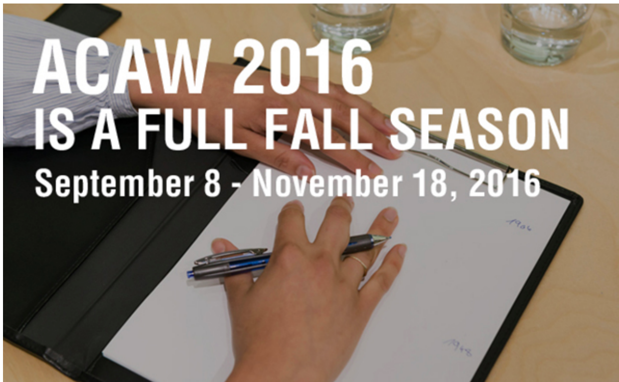
Asian Contemporary Art Week Poster, 2016.

Asia Contemporary Art Week is a series of exhibitions, events and symposia held across New York City that seeks to heighten the awareness and visibility of contemporary art practices from Asia within the United States and Asia. A range of institutions is participating in New York between 8 September and 18 November 2016.