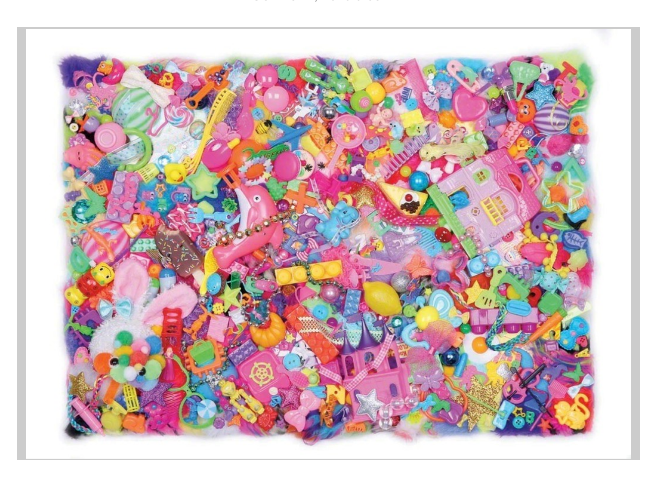
ARTSY OCT 28TH, 2016 9:08 PM