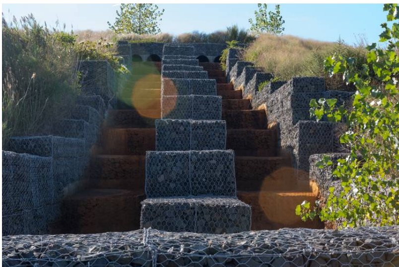
A drainage structure at the former Fresh Kills Land Fill in Staten Island, which was once the largest garbage dump in the world and is being transformed into a park.

The project, “Landing,” calls for two sculpted mounds of dirt and grass, each about 100 feet long, plus a cantilevered platform that will extend out into open space above a scenic waterway. Little has been built, since navigating the layers of municipal approval has proved a laborious process.