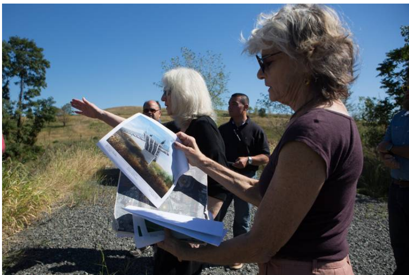
TRASH TALK: Artist Mierle Laderman Ukeles, center, in black, discusses 'Landing,' an installation planned for the new park at the former Fresh Kills landfill in Staten Island.

In 1983, for a piece called "Social Mirror," she outfitted a garbage truck with a silver surface to reflect onlookers' gazes back. Its message, Ms. Ukeles said: We are all implicated in the life of the trash we make.