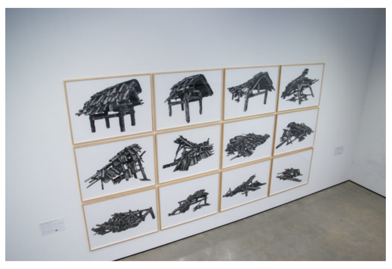
NADIAH BAMADHAJ, Pessimism is Optimistic IV, 2017, charcoal on paper collage, framed Dimensions: 47.24 x 59.06in. (120 x 150cm) each (12 pieces total).

whisper a wistful longing or a search for meaning subverted. The only certainty of the work lies anchored in the twisted trunk, reaching down toward the gallery floor. The sheer scale of the work invites visitors to appreciate the wonder of the natural world as re-created in organic materials.