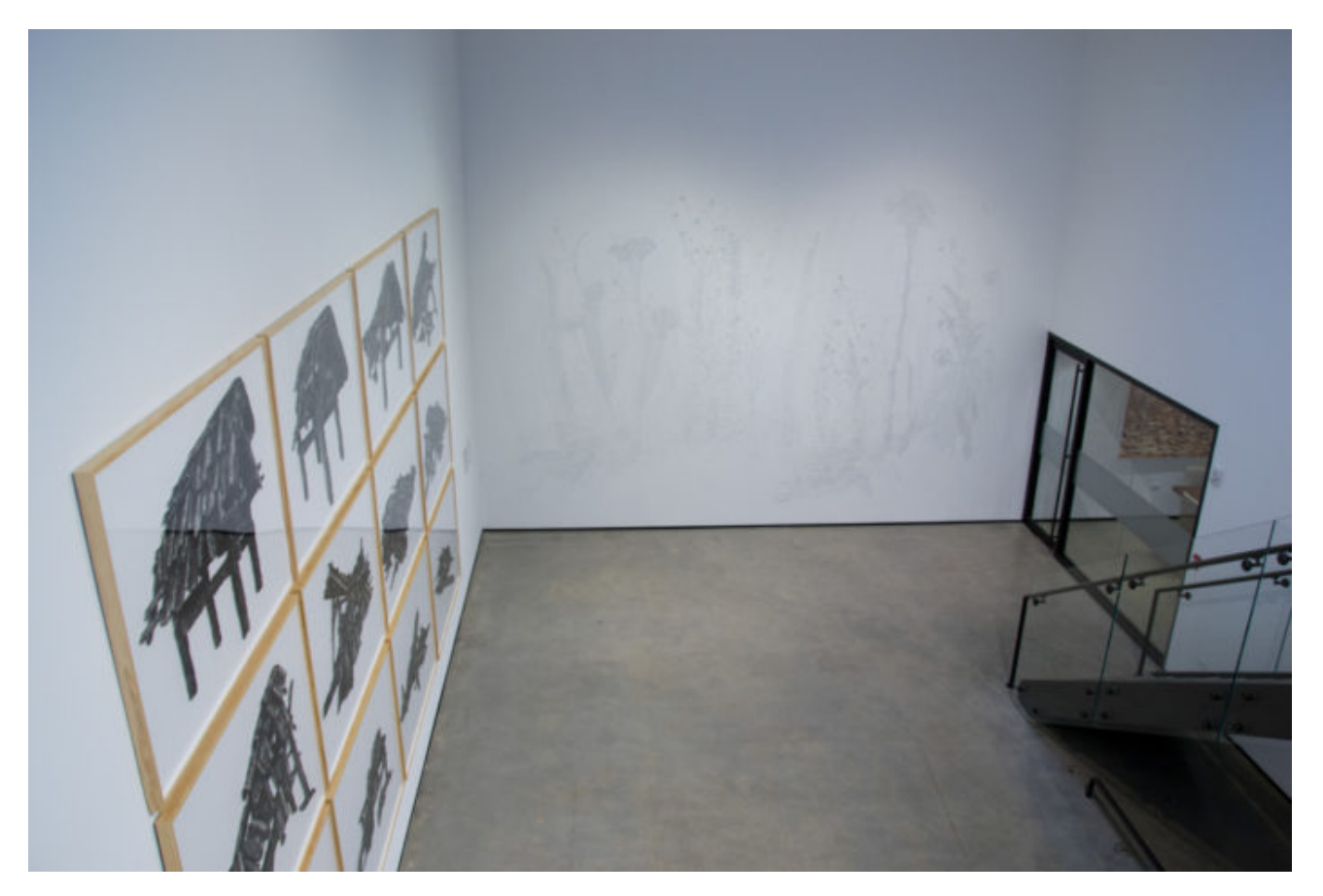
ACAW's Thinking Projects Pop Up at C24 Gallery, installation view.