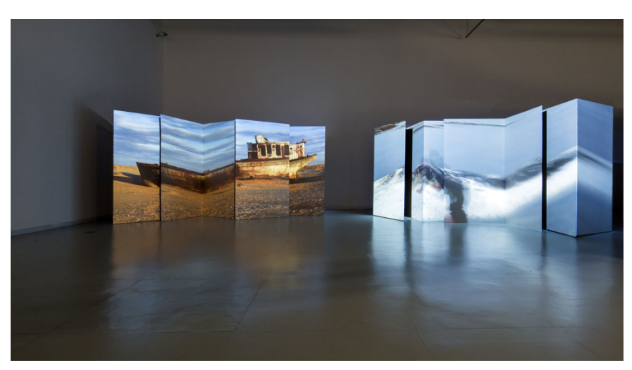
Installation view of The Wandering Lake by Patty Chang at Shanghai Biennale, 2016.

Patty : The book is the backbone. When organizing the project for myself, it always lived as a narrative that keep expanding in directions not necessarily linear.