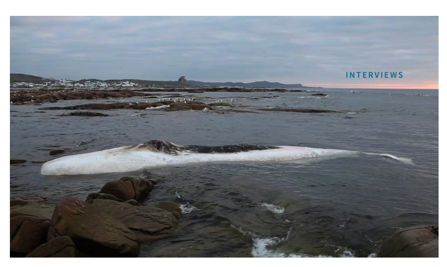
Still image from The Wandering Lake by Patty Chang

By Alex Teplitzky | September 15, 2017 -