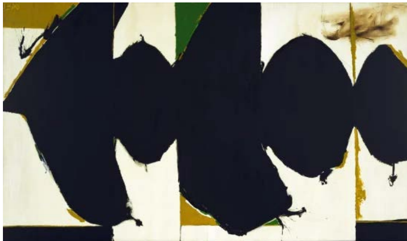
▲ Robert Motherwell, Elegy to the Spanish Republic No. 108

This reminds us that Wang Dongling's chaos script performance was itself a product of multiple cultures. The Heart Sutra is an example of the influence of Buddhism on China. Teaching foreign students in China in the 1980's, Wang Dongling already began to examine the Chinese calligraphic tradition from an outsider's perspective and to realize its universal significance. For example, he has observed the zhou 州 character as written by Yan Zhenqing in Robert Motherwell's Elegy to the Spanish Republic series.