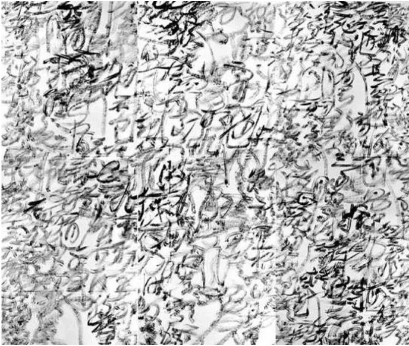
▲ Free and Easy Wandering in chaos script, 2015