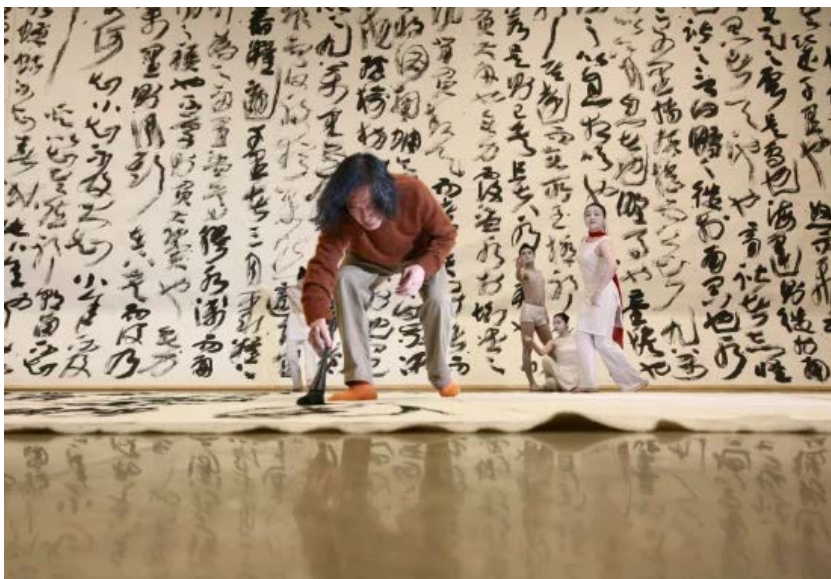
▲ Ink-Dance on West Lake, 2012

Wang Dongling's monumental works of mad cursive calligraphy respond sensitively to particularities of mood, atmosphere, time, and space. He describes his state of being when executing them as a "solitary communion with the spirit of heaven and earth." Breaking free from rules and conventions, chaos script achieves a perfect balance of self-expression and the embodiment of the mad cursive tradition. It also incorporates the artist's experience of the United States, particularly his appreciation of the Abstract Expressionist painting.