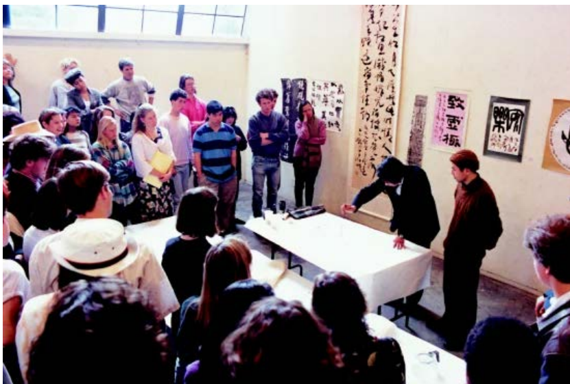
▲ Wang Dongling and students

Remaining convinced of Chinese calligraphy's cultural value and self-expressive capacity, Wang Dongling saw it as a unique contribution to world art. Through its trans-linguistic formal qualities, he could create a dialogue between Chinese traditions and the world. Between 1989 and 2015, he organized 15 solo exhibitions in the United States to introduce the fruits of his tireless artistic experimentations. He believes that "form and content are intimately connected. New content inheres in every new form."