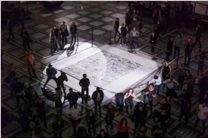
▲ Afro Flow Yoga

After the work was cordoned off, a group activity combining dance, percussive music, and yoga called Afro Flow Yoga took place around it.