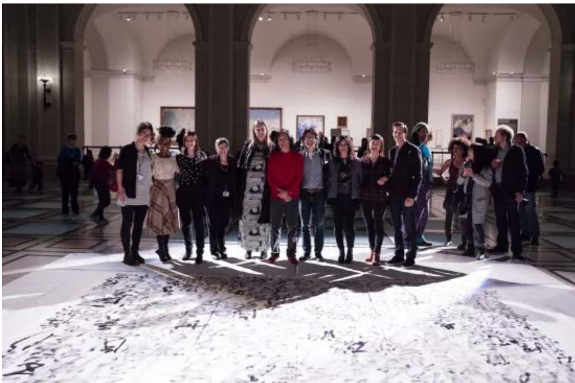
▲ The Artist with the INK studio and Brooklyn Museum teams