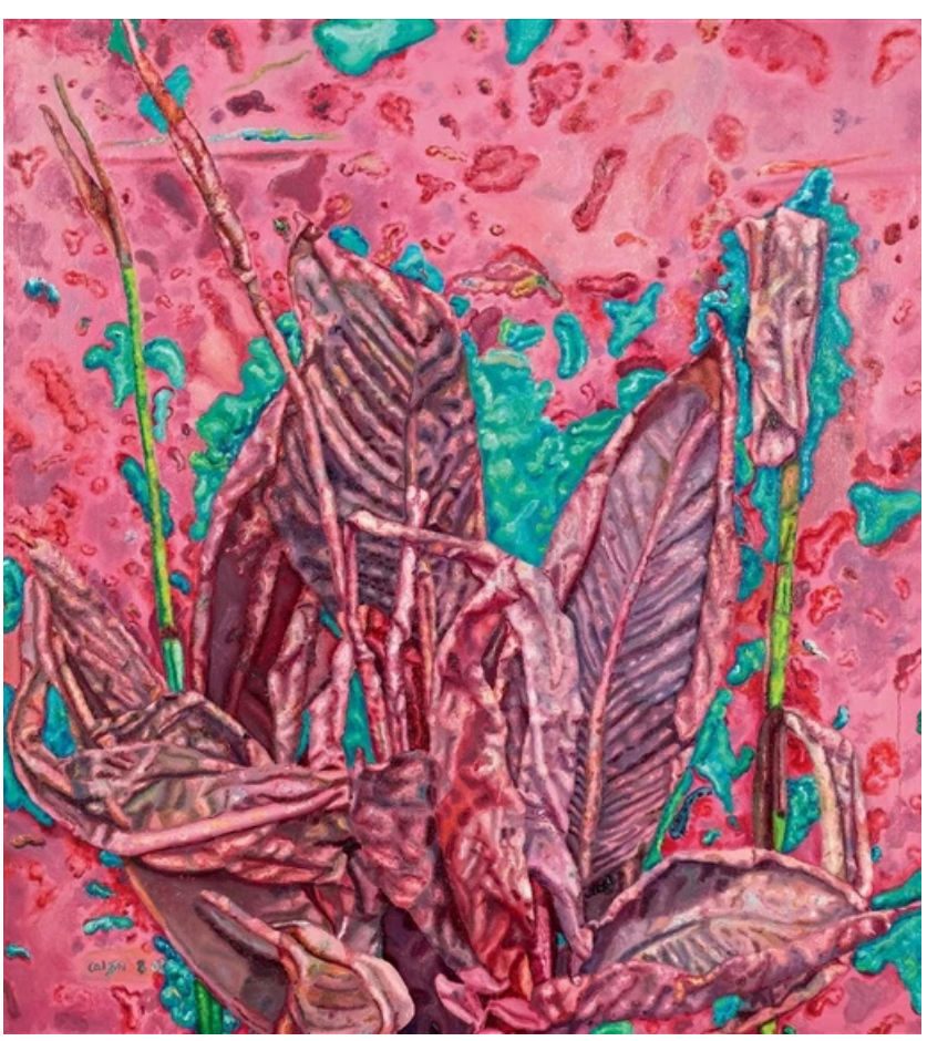
Cai Jin, Beauty Banana 205 , 2003. Oil on canvas.

Goedhuis Contemporary 42 E. 76th St. (Park & Madison Ave.) Tel: 212.535.6954