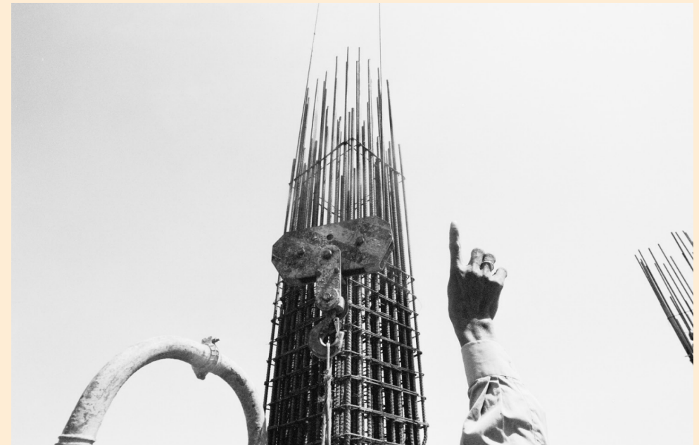
Vandy Rattana, First High-Rise , 2008, Digital C-print, courtesy of the artist