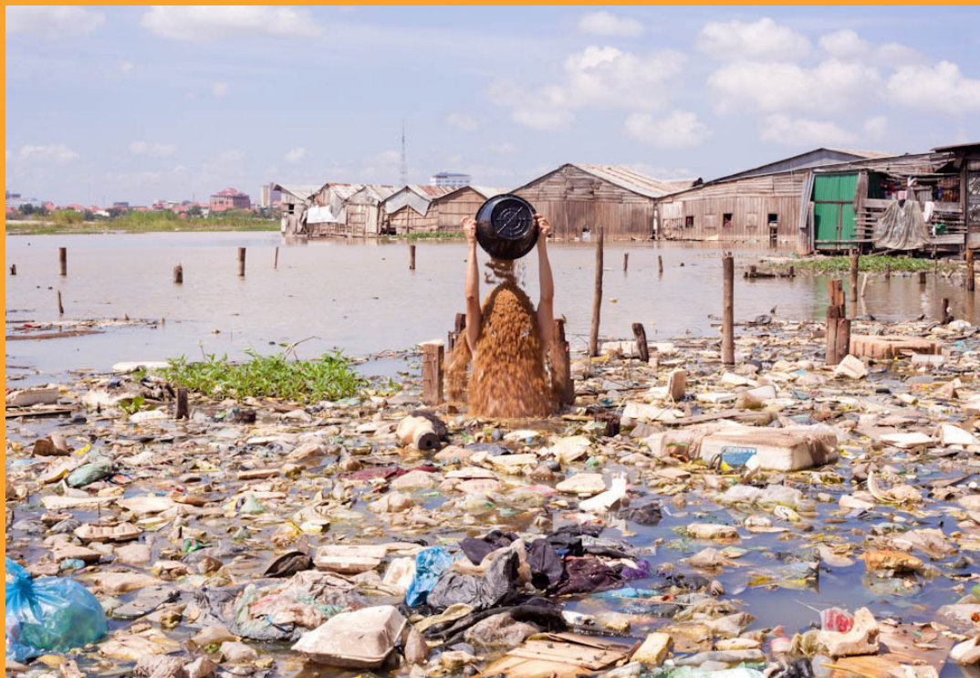
Khvay Samnang, Untitled , 2011. 5-channel HD video installation with sound.