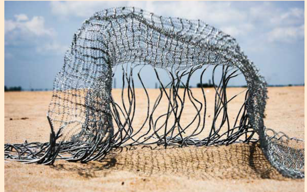
Tith Kanitha. Endlessly , 2011.