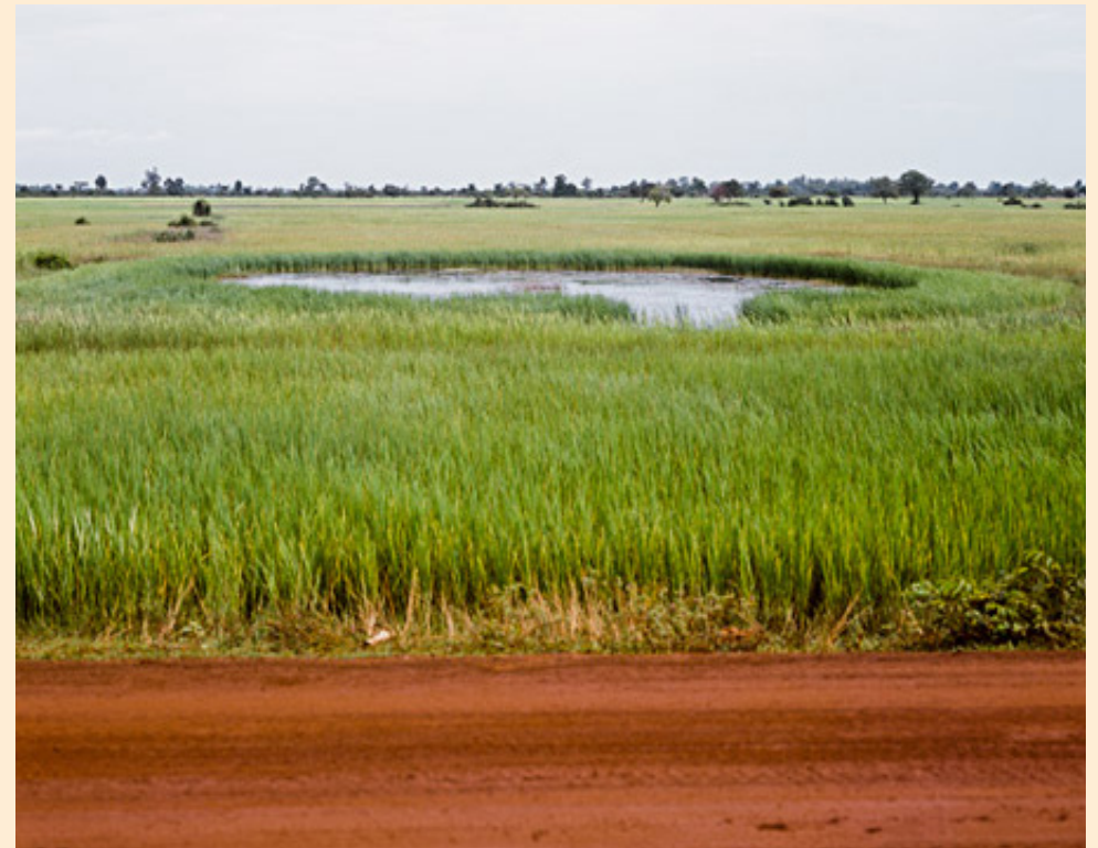
Vandy Rattana, Kompong Thom , 2009, Digital C Print, 90x105cm, courtesy of the artist