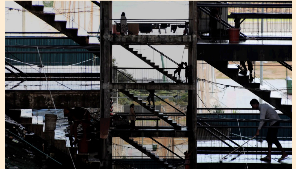
Masaru Iwai, White Building Cleaning , 2012, single-channel video, courtesy of the artist