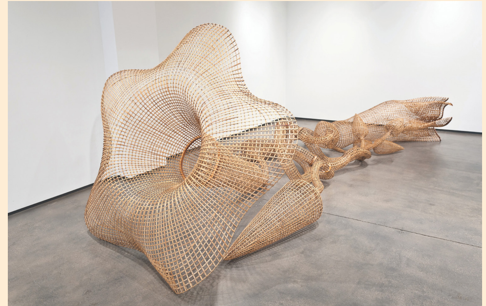
Sopheap Pich, Morning Glory , Rattan, bamboo, wire, plywood, steel bolts. 2011, 210 x 103 x 74 in. courtesy of the artist and Tyler Rollins Fine Art